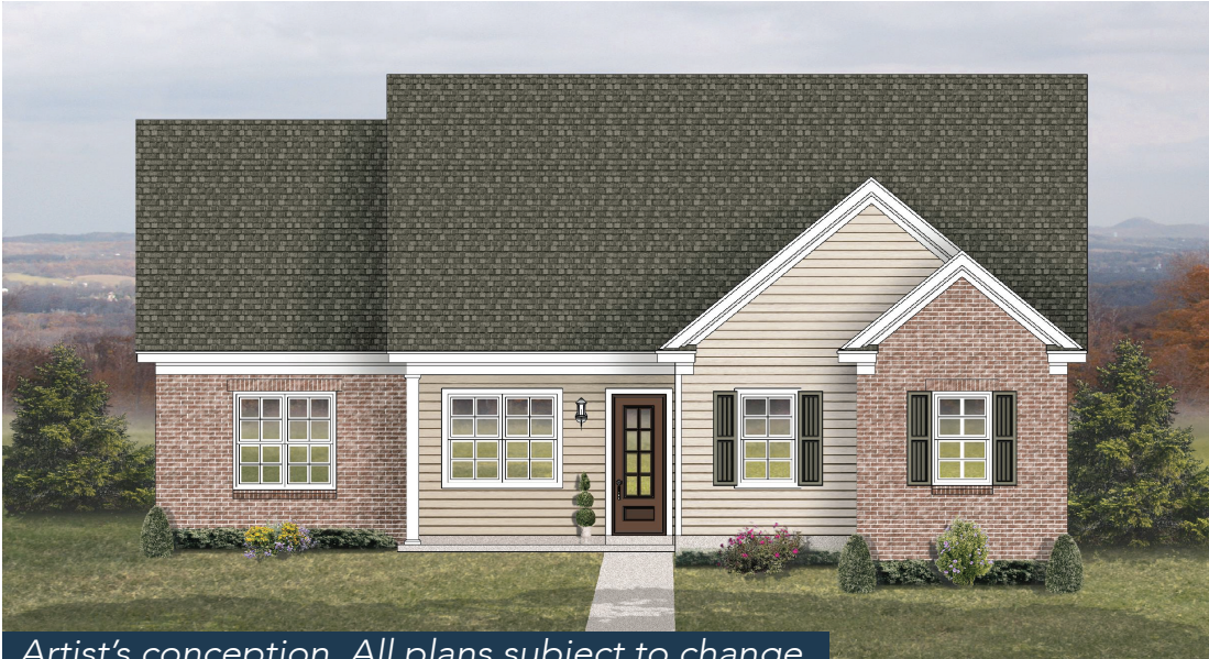
Artist's conception. All plans subject to change.