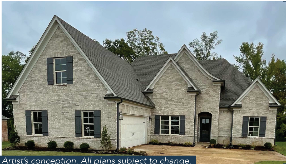
Artist's conception. All plans subject to change.