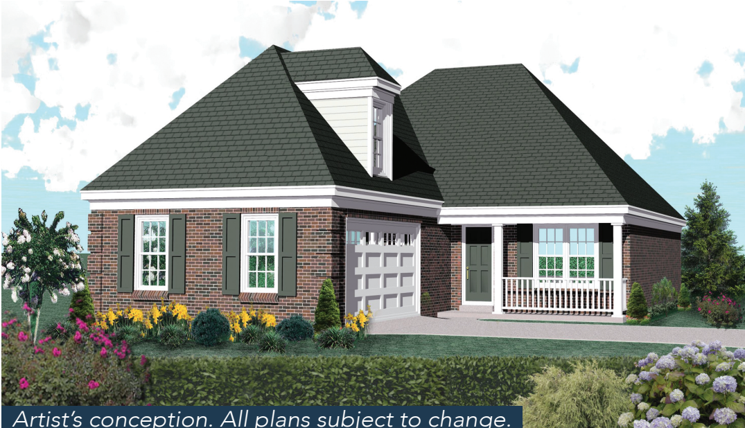
Artist's conception. All plans subject to change.