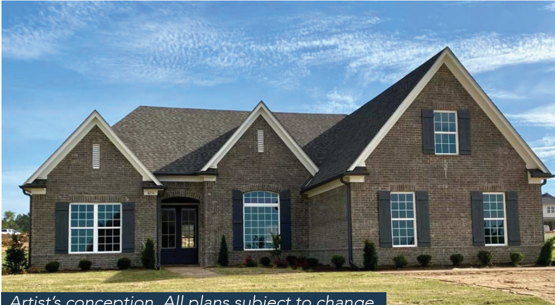
Artist's conception. All plans subject to change.