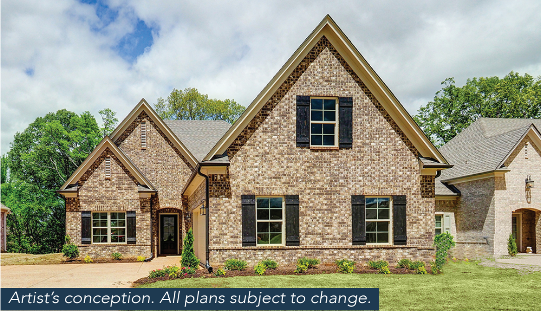
Artist's conception. All plans subject to change.