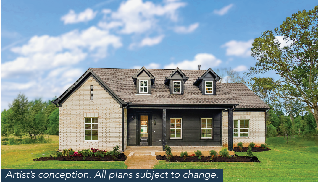
Artist's conception. All plans subject to change.